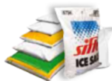
Bags made from continuous film