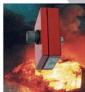
Spark detection and extinguishment