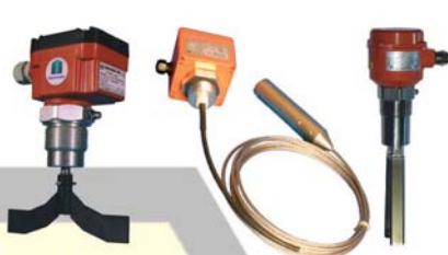
Level and continuous level sensors