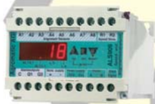
Safety control for elevators speed and alignment control