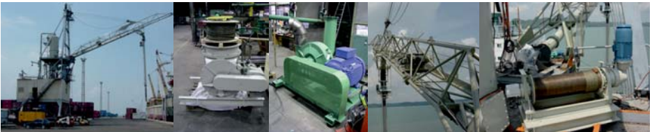
Philippines - new boom, blowers, filter, airlock, winches