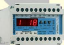
bearing temperature monitoring