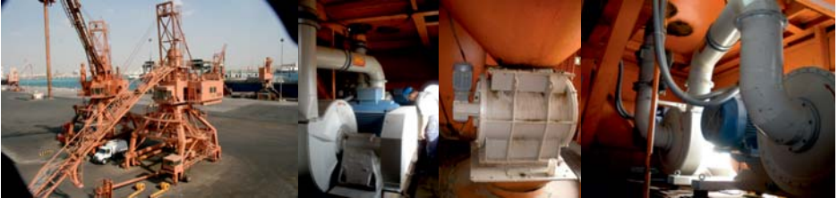
Saudi Arabia - new blowers, airlocks