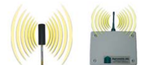
Temperature measuring systems for flat storages or silos, digital and wireless