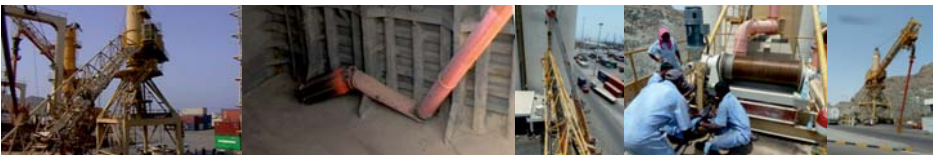
Oman - new boom, pipes, boom winch