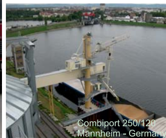
Combiport 250/120 Mannheim - Germany