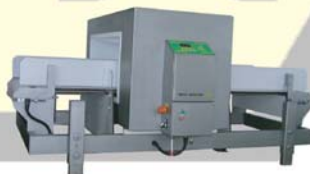
Metal detection for freeflowing, for packed products or in pneumatic line