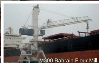
M300 Bahrain Flour Mill