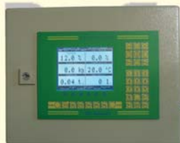
Automatic dampening systems